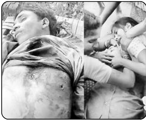
Victims of Sangh Parivar violence