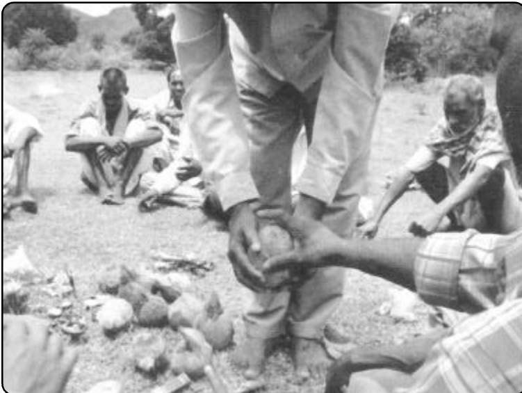
The 'Ghar-Vaapasi' ritual